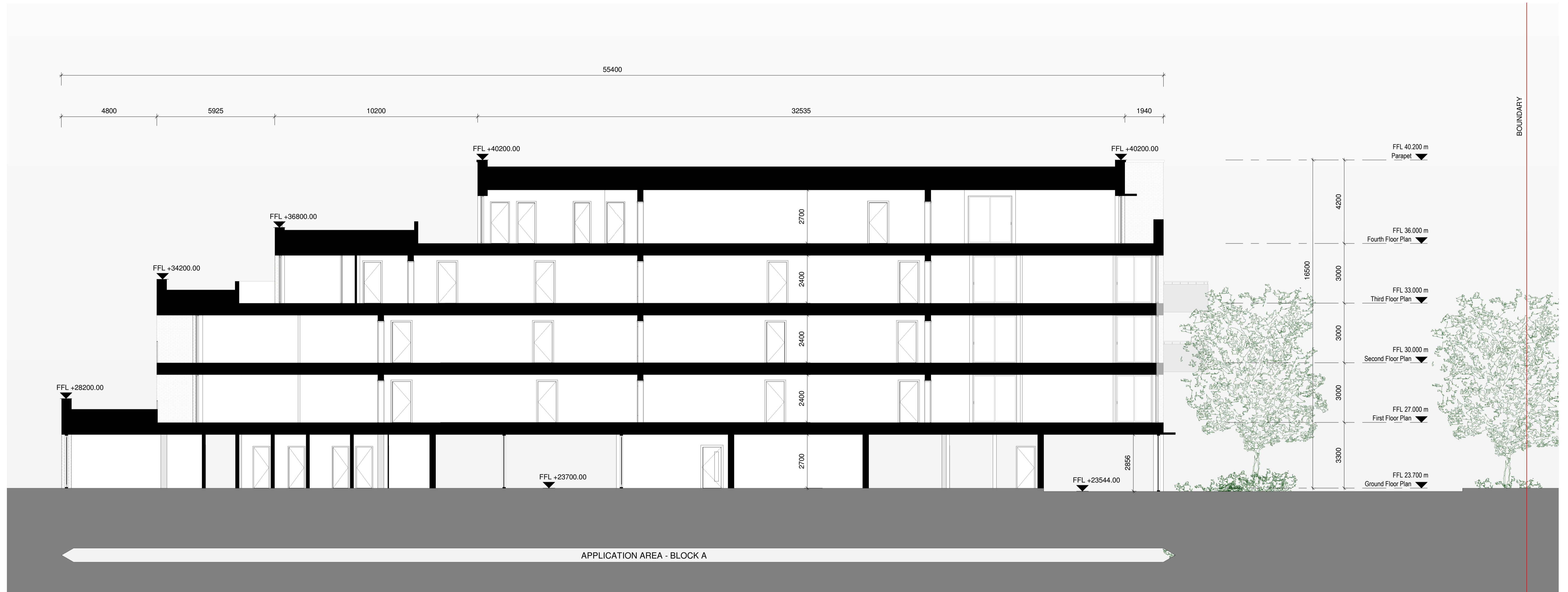
1 Cross Section BB_Block A 1 : 100