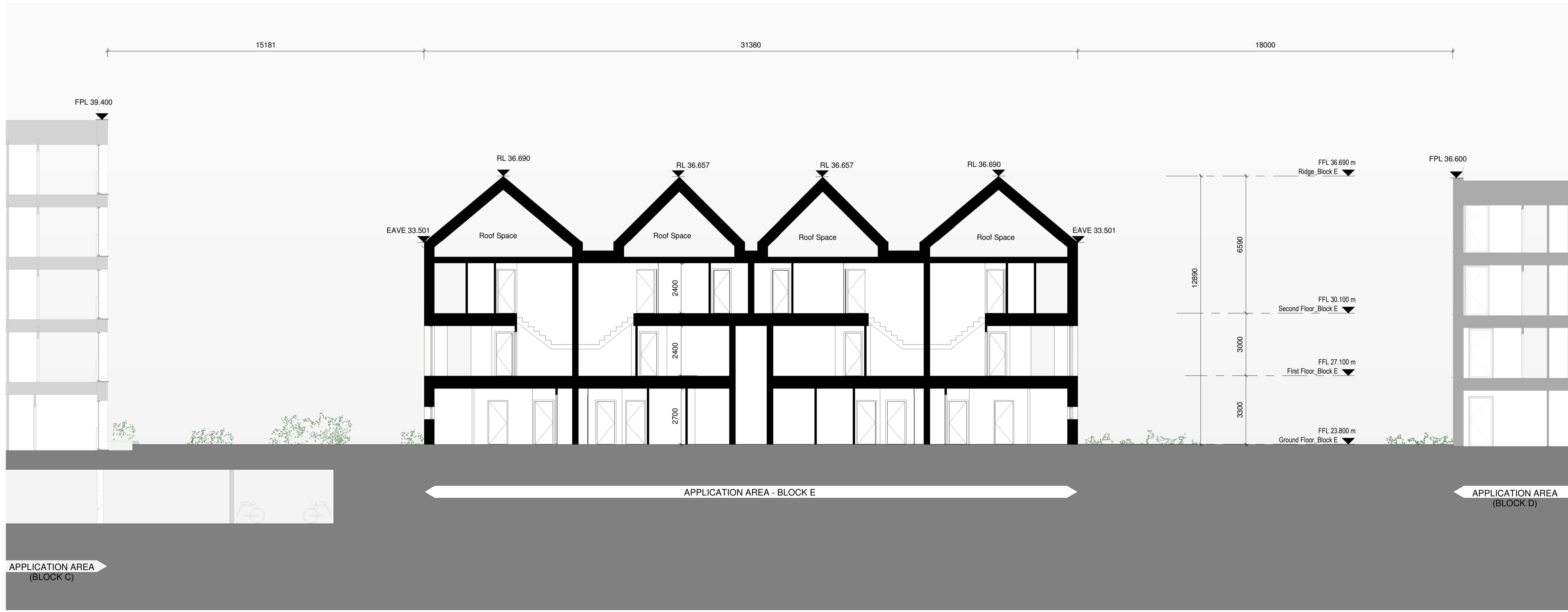
1 Cross Section BB_Block E 1 : 100