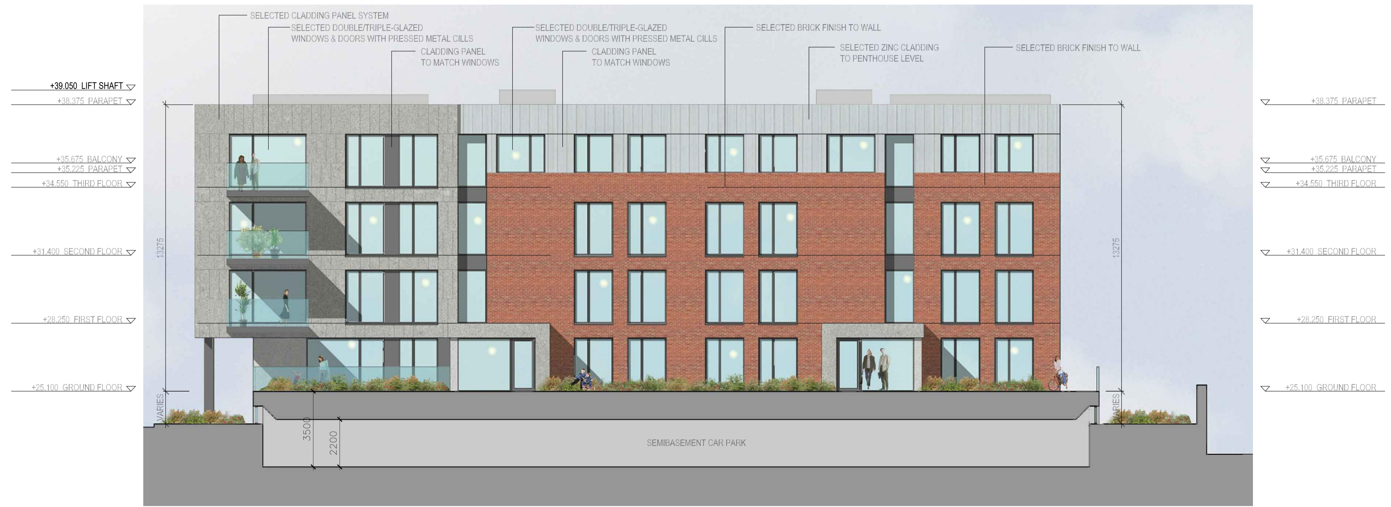
BLOCK B - EAST ELEVATION

APPROVED Block B EAST ELEVATION Scale 1:100 @ A1