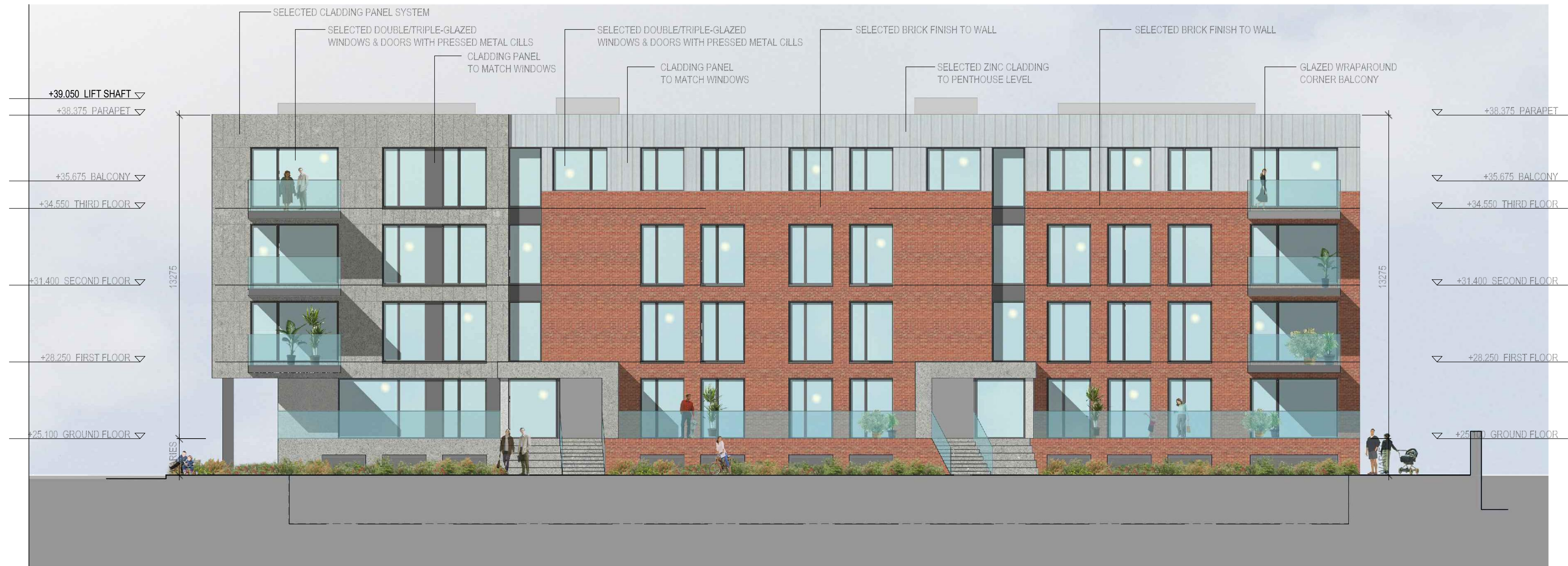
BLOCK C - EAST ELEVATION

APPROVED Block C EAST ELEVATION Scale 1:100 @ A1