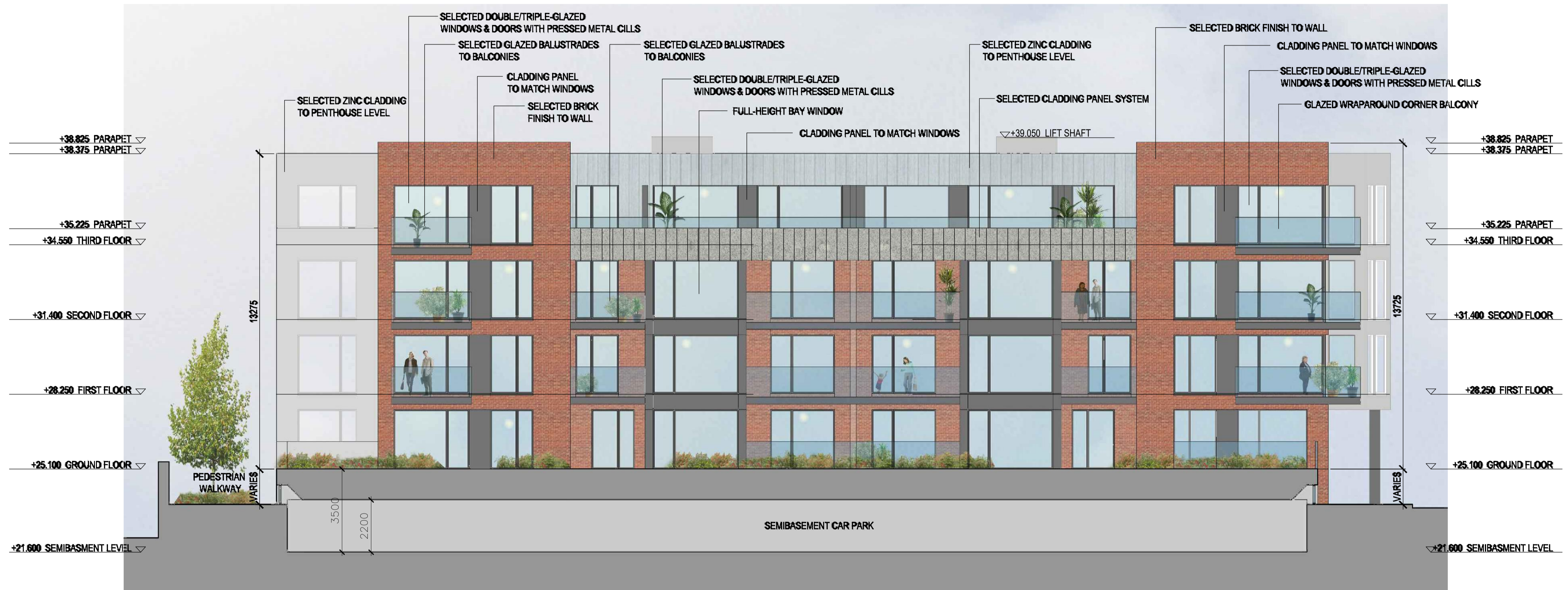
BLOCK C - WEST ELEVATION

APPROVED Block C WEST ELEVATION Scale 1:100 @ A1